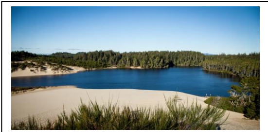
Honeyman State Park