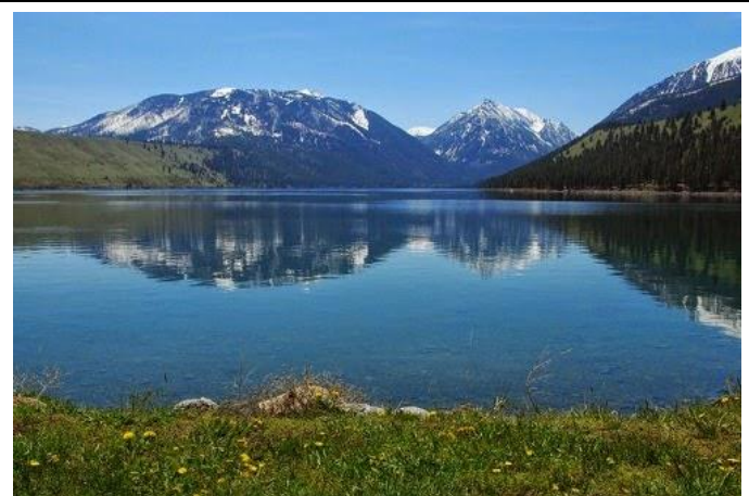
Wallowa Lake State Park