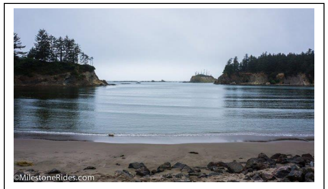
Sunset Bay State Park