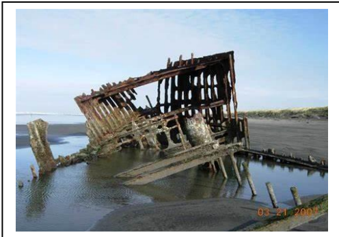
Fort Stevens State Park