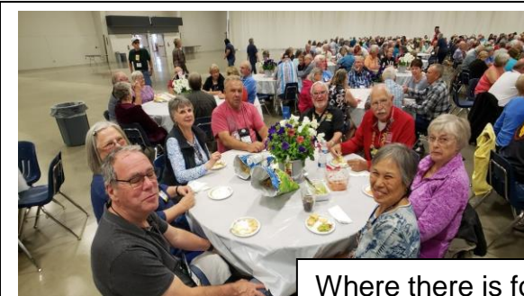
Where there is food there is fellowship.