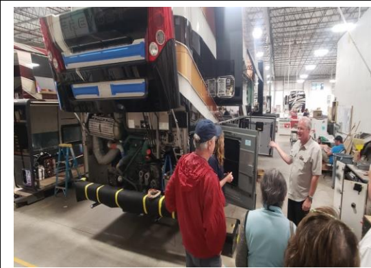
A little bit of this & some of that.