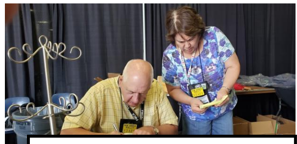
Inventory count has to be correct