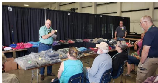
Getting the store ready