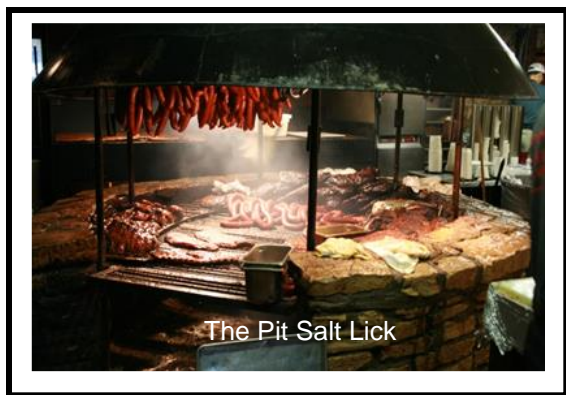
The Pit Salt Lick

Selvidges – While on the beach in Rockport it was 70 degrees. We enjoyed the Oysterfest in Rockport.