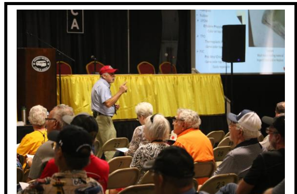
Many workshops provided good info

of the organization. The IRS limits how much Unrelated Business Income The program had to be transferred to the FMCA for-profit organization and the new provider became AT&T. Because of how the issue was handled, some additional costs were incurred so that FMCA's nonprofit status was not threatened.