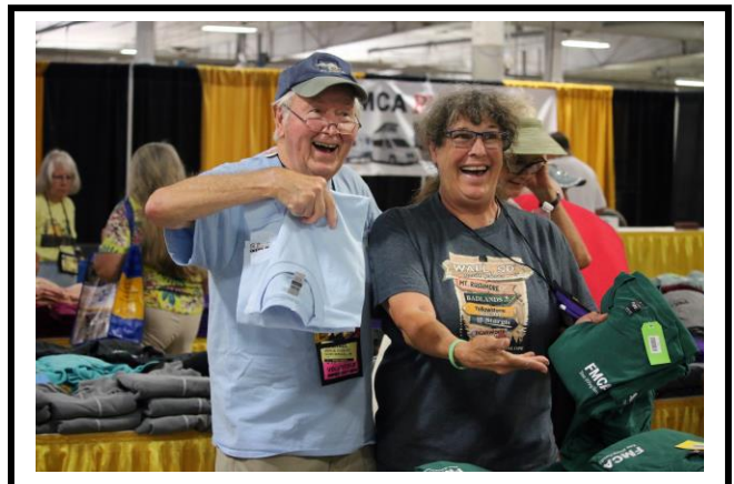
Staffing the store – look familiar?

Consideration is being given to having an international convention in Redmond, Oregon again.